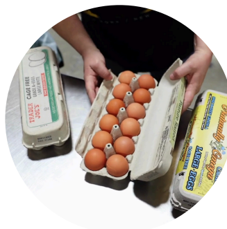
Pictured: Clackamas Community College Food Pantry

- Melinda Nickas, Faculty, Clackamas Community College Food Pantry , serving approximately 2,000 people monthly